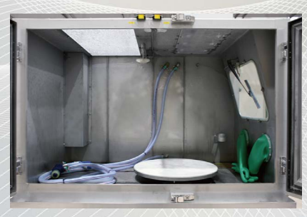
Processing chamber with rotary table